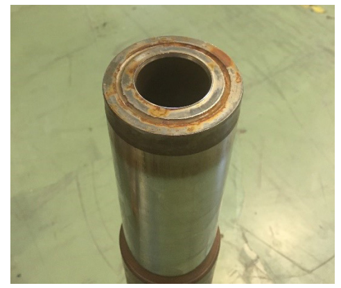
Piston after 2 500 meters of drilling