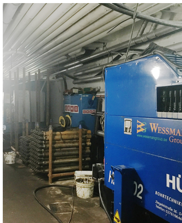
Drill rods to be used drilling for geo-energy